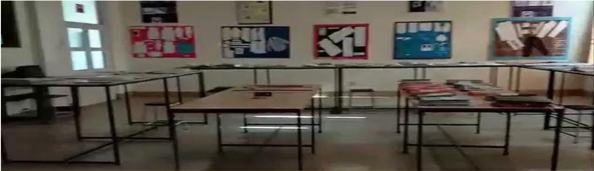
Department of Textile Engineering UET Lahore, Faisalabad campus